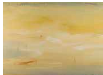
p.24 — p.25 Composition N°18. 4. 21 2021