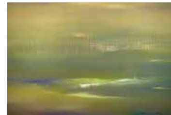
p.44 — p.45 Composition N°8. 3. 23 2023