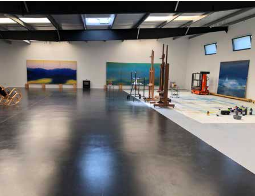
Feng Xiao-Min studio in Fontainebleau, France