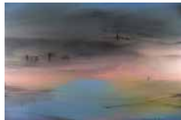
p.28 — p.29 Composition N°2. 4. 22 2022