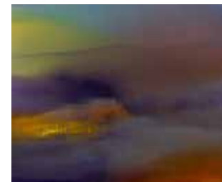
p.48 — p.49 Composition N°10. 8. 23 2023