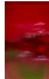
p.38 — p.39 Composition N°24. 12. 23 2023