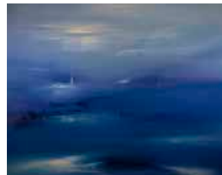
p.32 — p.33 Composition N°20. 6. 22 2022