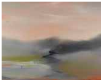
p.22 — p.23 Composition N°22. 3. 21 2021