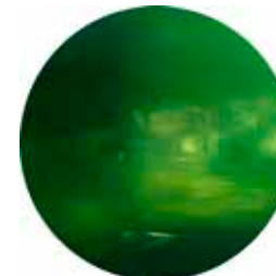
p.56 — p.57 Composition N°28. 2. 24 2024