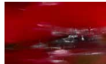
p.42 — p.43 Composition N°18. 12. 23 2023