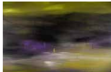
p.34 — p.35 Composition N°28. 4. 22 2022