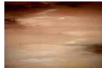
p.40 — p.41 Composition N°28. 3. 23 2023