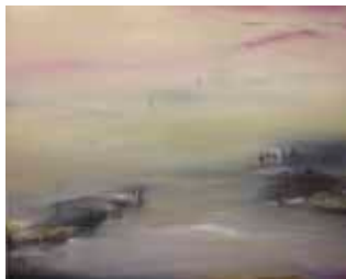
p.16 — p.17 Composition N°8. 4. 19 2019