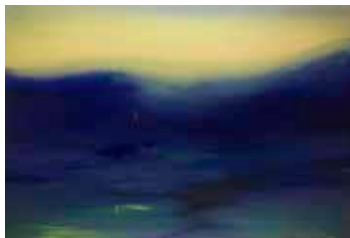
p.20 — p.21 Composition N°18. 11. 20 2020