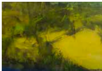
p.12 — p.13 Composition N°9. 3. 10 2010